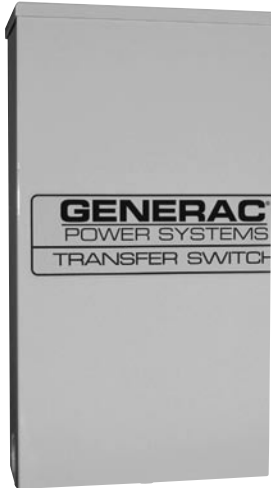
100 – 400 Amp RTS NEMA 3R