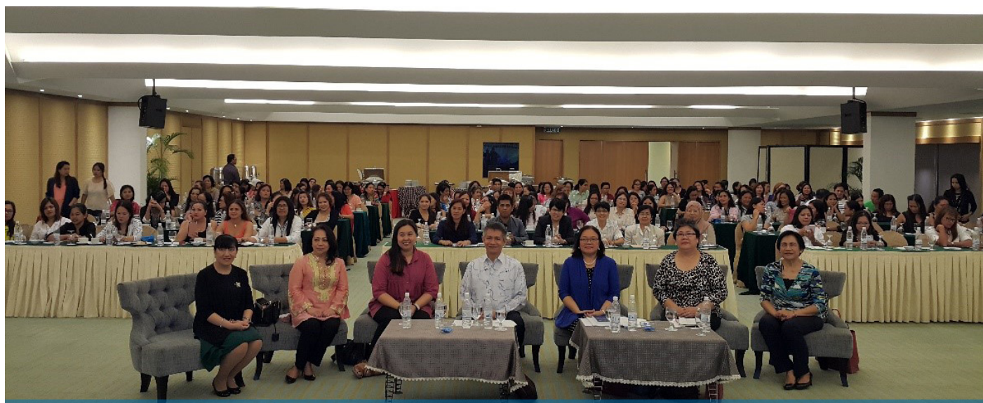
The resource speakers together with the participants to the International Forum in Kuala Lumpur, Malaysia.