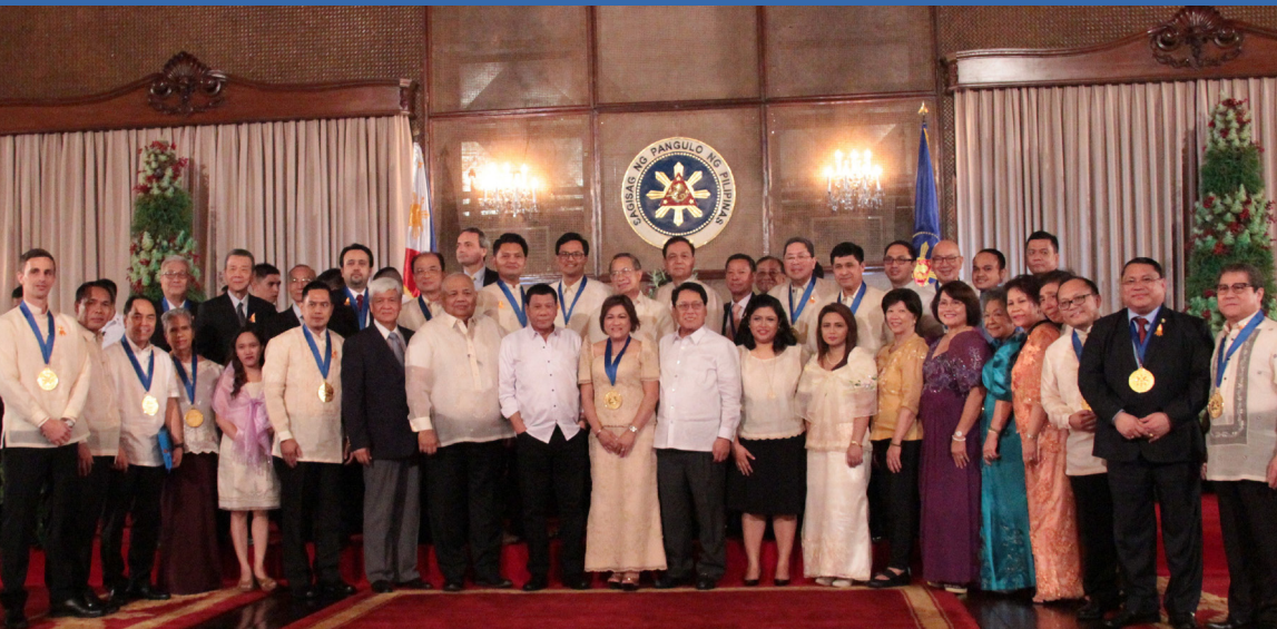
President Rodrigo Roa Duterte together with the 23 distinguished and outstanding overseas Filipinos and foreign-based organizations