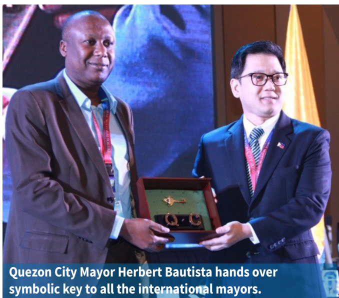
Quezon City Mayor Herbert Bautista hands over symbolic key to all the international mayors.

With more than a hundred local chief executives in attendance led by Mayor Herbert “Bistek” Bautista, the international forum with the theme “Governing Locally: City Leadership at the Front and Center in Implementing Migration Policy – Promoting Development and Securing Protection” served as a platform to discuss the important role played by local and regional authorities in the migration and development discussion.