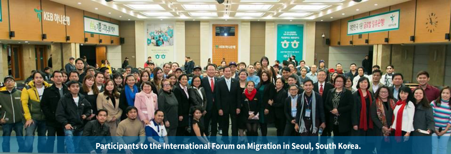
Participants to the International Forum on Migration in Seoul, South Korea.