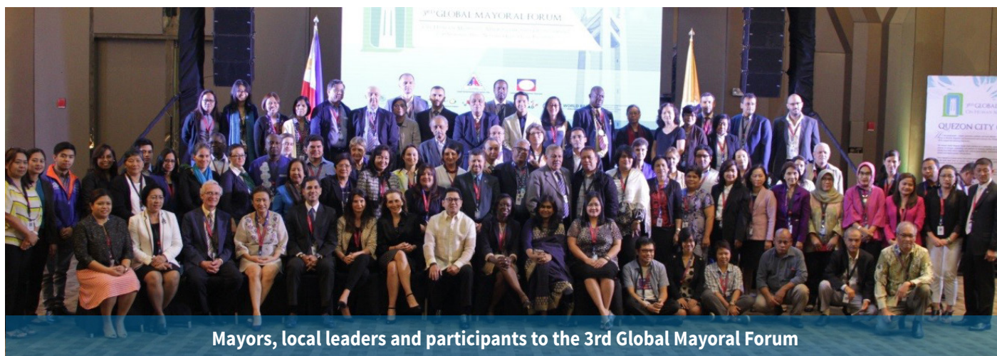
Mayors, local leaders and participants to the 3rd Global Mayoral Forum

Quezon City Government successfully hosted the 3rd Global Mayoral Forum (3GMF) on September 29-30, 2016 at Novotel Hotel with the event receiving tremendous response and participation from mayors, governors, prefects and other local officials from across the globe. The Mayoral Forum is an annual gathering of mayors and city leaders serving to promote globally relevant policy dialogue, foster the exchange of experiences in governing migration, and strategize on how to work collectively.