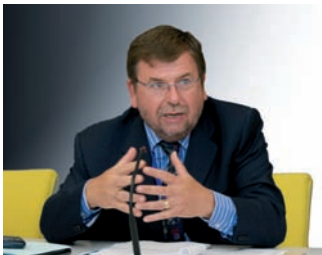
Jean-Louis Laurens Director General of Democracy and Political Affairs of the Council of Europe – Strasbourg, June 2009

Since its creation in 1949, as a pan-European organisation the Council of Europe has undertaken the mission of defending democracy, human rights and the rule of law. To this end, the network of schools of political studies was set up, as one of our principal instruments, to accompany democratic transition in eastern and central Europe after the fall of the Berlin Wall. I am convinced that it would be possible to apply this concept elsewhere in the world, in countries attached to the same universal values as those which we encourage young leaders in new European democracies to promote