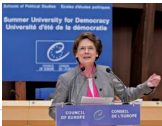
Catherine Lalumière President of the European Association of Schools of Political Studies

“The European project is a large-scale project with an economic dimension, a social dimension and a philosophical dimension - making it a genuine political project. This Association gives us an opportunity to collectively think about what the European project means and the international role of the Europe that we are building together. I firmly believe that the Association of Schools is vitally important as a forum for continuously reflecting on and revitalising the European project and for ensuring that it is about more than just economic prosperity»