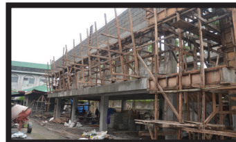
Basilica Office which is the former Basilica Kaffee.

nb: No picture: Additional Rest Room near Canteen