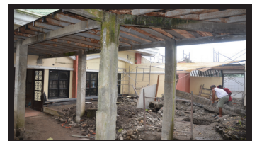
Staff Quarters which is located at the back of altersheim

nb: No picture: Additional Rest Room near Canteen