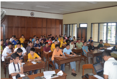
The Concas pre-fielding at the Catechetical Center last March 29-30 before being sent to parishes