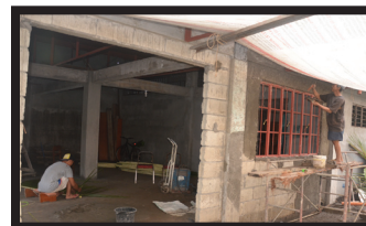
Basilica Bodega. This is at the back of the hall. It is almost completed.