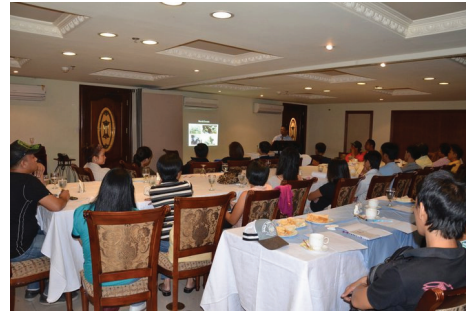
The Media Recollection last year at the Villa Caceres