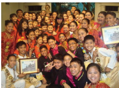
The winning Children's Choir of St. Barthomew Parish, Baao, Camarines Sur

With much pride and joy, the Archdiocese of Caceres congratulates the Baao Children's Choir for taking the first place in the 18th Youth Torrevieja Habaneras Contest in Spain last April 27-29, 2012. Held at the Teatro Municipal de Torrevieja, eight chorale groups from all over the world sang their way to Spain as finalists. The Baao Children's Choir received three thousand euros along with a glass trophy as their prize.