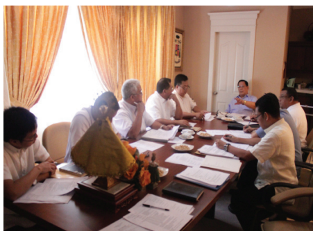
The Penafrancia Committee Meeting with the Archbishop at his Office

The Archbishop emphasized the need to appreciate our Catholic faith with the devotion to INA. During the novenary of masses, the daily themes will be developed by the priests in their homilies. Likewise, catechetical instructions and formations will also focus on the theme.