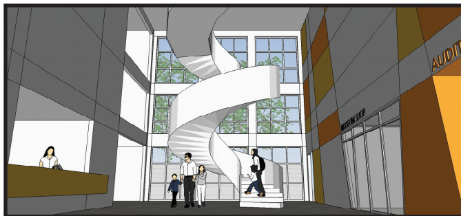
Lobby and Spiral Staircase