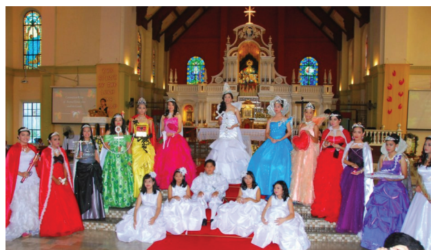
The Reyna Elena 2012 and her court

The Reyna Elena was held to honor the finding of the Holy Cross by St. Helena. It was also a fund raising of the Basilica for the construction of the Museo de Ntra Sra. de Penafrancia of which the cornerstone was laid also last May 26.