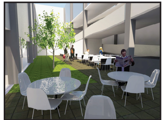
The courtyard with al fresco dining