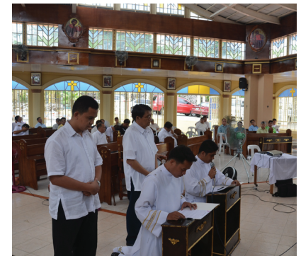
The deacons of Caceres who will be ordained come June 2012