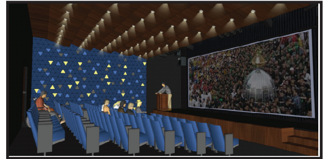
The Multimedia Room