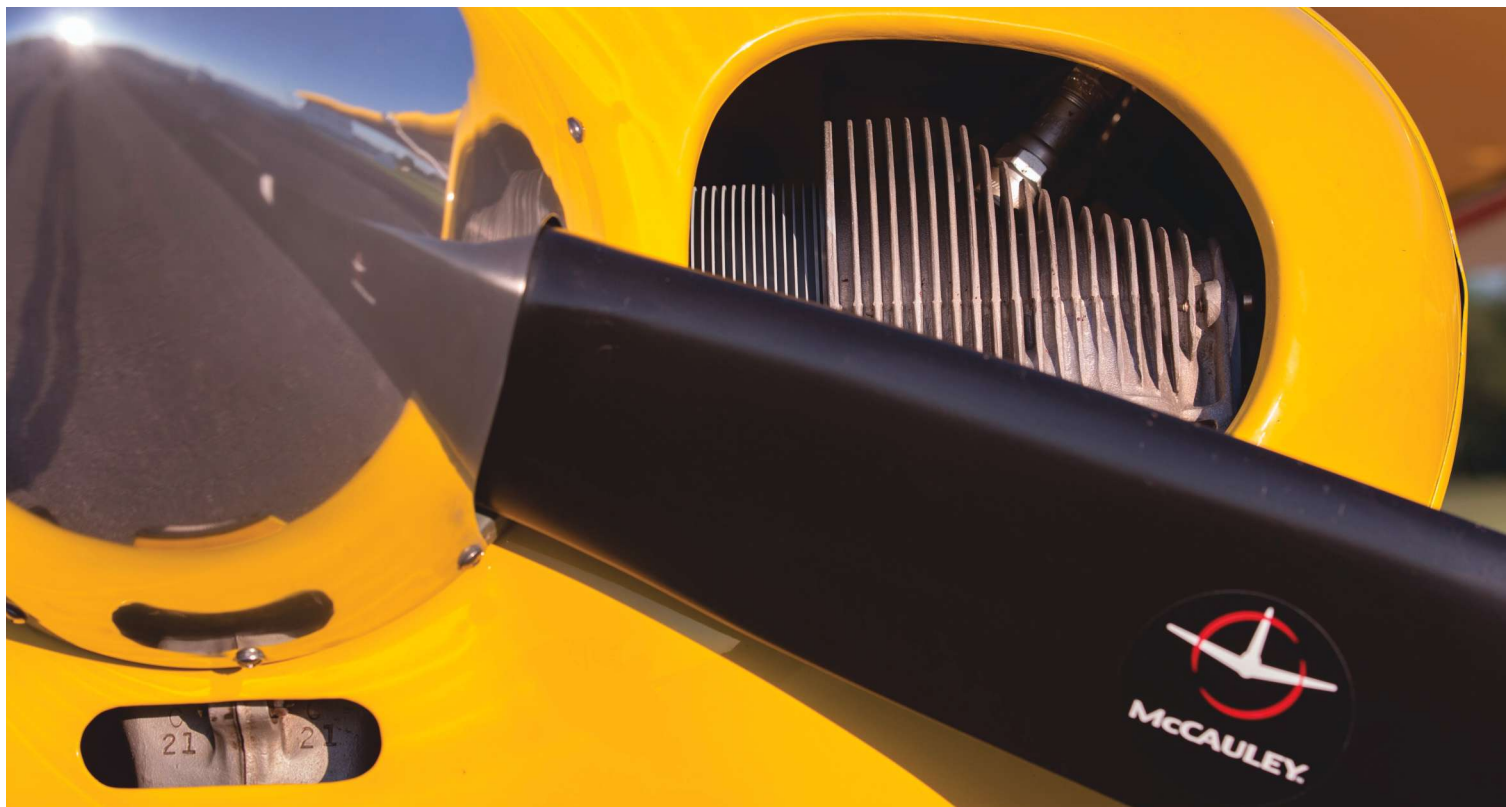
The Continental C-90 engine helps the airplane perform nicely, even with two people on board.

At one point, someone peeked through a crack in the door and said something about a yellow airplane being slammed around. Even though my airplane was yellow, I knew it couldn't be mine because my airplane was in Row 16 and he was looking far to the right. When the tornado passed and they finally opened the doors, even though it was still raining hard, I bolted out of the building. I couldn't believe it when I found my airplane six rows from where I had tied it down. It was lying on its belly, the right wing on the ground and the left pointing to the sky. For the first time in my entire life, I didn't have the slightest idea what to do. Everyone was walking around like zombies, me among them. The shock was overwhelming."