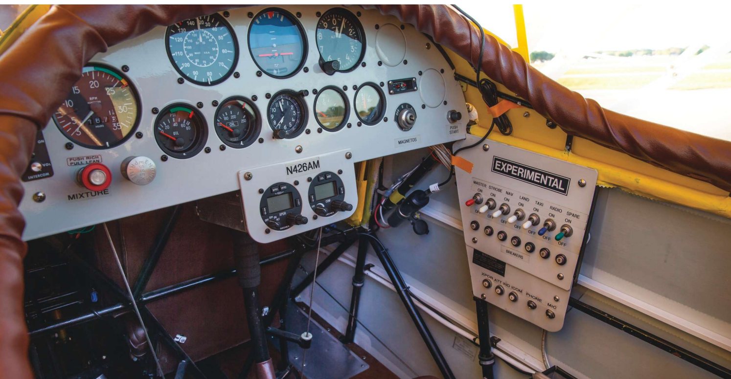
The instrument panel and its detail are not something normally associated with an open-cockpit parasol; that's one of many reasons the airplane has won so many awards.