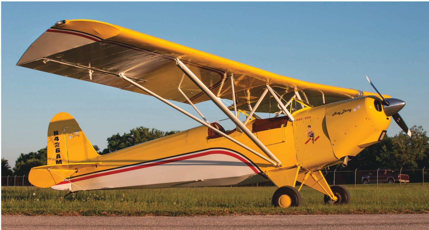
Back to its former grand champion plans-built glory; it's hard to believe the airplane had been cartwheeled across six rows at Sun 'n Fun.

Money was hard to come by, and finding parts on the island was not easy. Plus the shipping and handling was killing his father, but the airplane got built piece by piece, moving slowly but steadily forward.