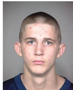
Robert OJ Simpson Robbery