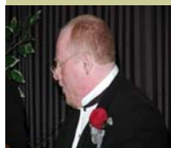
Our Executive Director, dressed for success while sharing his thoughts.