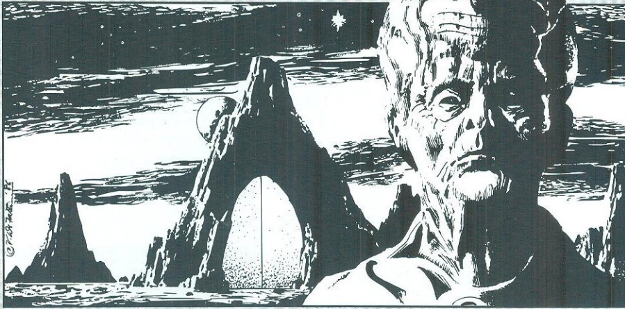
Talos IV, inhabitants have powerful mental techniques.

Home of sandbats, which resemble rock crystals until disturbed ("The