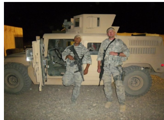
Cheeks rollin' hard

soup de jour on page 1. Are you curious about when your LAN drops are going to be installed? Call the Help Desk. We bring you everything you wanted to know and some things you didn't want to know in all it's 10 font, New Times Roman glory to give your eyes a low carb visual feast that will force your brain to go on an overweight profile. If it's news, it's here. If it ain't news, it's on MSNBC.