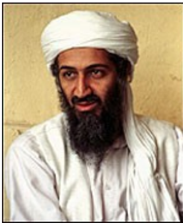
Early photo Dialysis