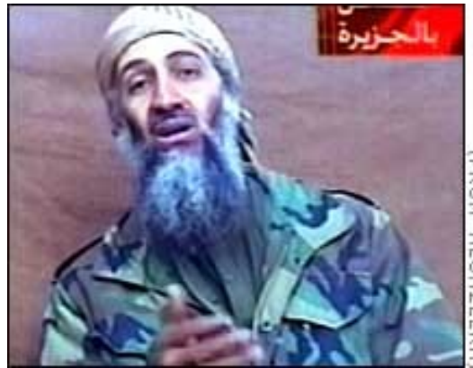
Dec 7, 2001 tape Very ill From Kidney